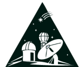
Talcott Mountain SCIENCE CENTER & ACADEMY