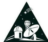
Talcott Mountain SCIENCE CENTER & ACADEMY