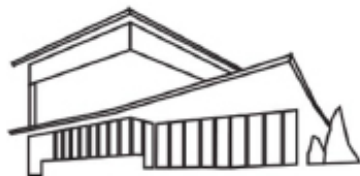
NEW BRITAIN MUSEUM OF AMERICAN ART

The STEM principles of exploration and discovery are a natural complement to the art-making process. From math-themed middle school tours in our galleries to engineering challenges in our ArtLab for our youngest visitors, the NBMAA embraces STEM + Art in our educational endeavors.