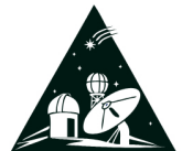
Talcott Mountain SCIENCE CENTER & ACADEMY